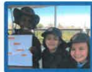
By : Simon Z 3 Red

Next we went to the African animals and we saw elephants, camels, giraffes and African dogs. Thanks to all the teachers who took us on the excursion!